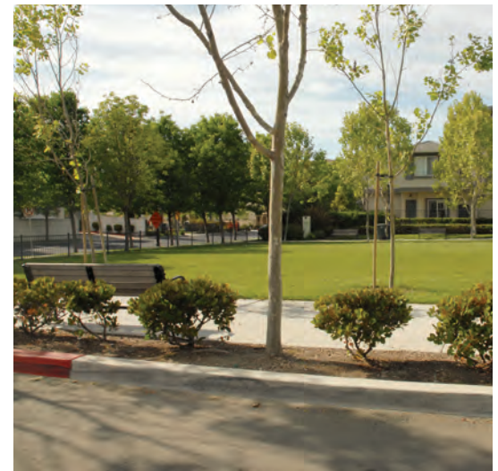
New park and recreation facilities will augment Turlock’s existing network of parks and open space.