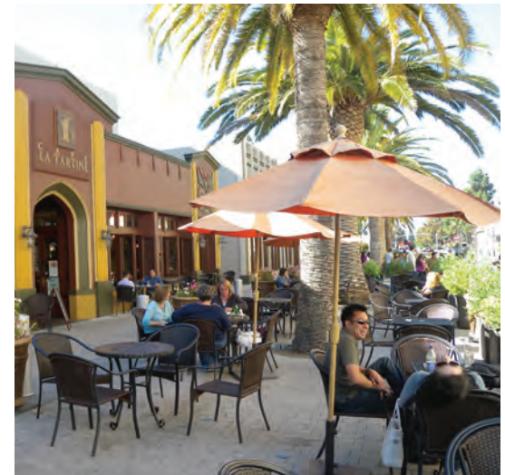
Complete, mixed use neighborhoods place residences closer to jobs, stores, and services; reduce long car trips; and create vibrant communities.

Issues of sustainability are addressed in elements throughout the General Plan: in Land Use, City Design, Circulation, Conservation, and more. By enabling alternatives to automobile travel and encouraging green building construction and sustainable site design, General Plan policies help achieve the increasingly important goals of protecting the natural environment and reducing greenhouse gas emissions. Turlock’s level topography makes it ideal for pedestrians and bicyclists. However, many destinations, such as shops, services, parks, and schools, are difficult or