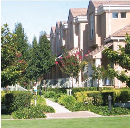
The General Plan enables and encourages the development of housing to suit all types of residents.