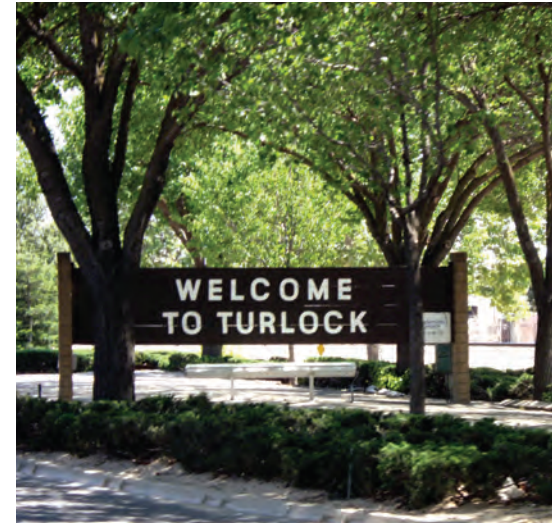
Turlock's new General Plan reflects the changes the city has seen over the last 20 years and presents a vision for the next 20.

The present effort, begun in 2008, represents a continuation of this planning tradition. The General Plan articulates a vision for Turlock that draws on the ideas of the many citizens, business owners, and elected officials who participated in the planning process. Designed to guide growth and development, the Plan emphasizes the creation of attractive new neighborhoods and successful employment centers, while preserving the valuable farmland in which the city has its roots.