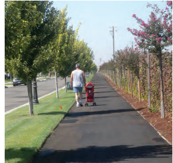
Planning for the needs of pedestrians, cyclists, and other transportation modes helps meet State requirements for greenhouse gas reductions and “Complete Streets.”