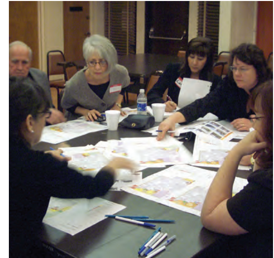
Residents weighed in on all aspects of the General Plan through a series of workshops, open houses, and focus group meetings.

The consistency requirement established by State law (Government Code Section 65300.5) and interpreted in several significant judicial decisions requires the separate parts of the Plan to be fully integrated and to relate internally without conflict. This horizontal consistency requirement extends to the diagram and figures, as well as to text, data, and analysis in addition to policies.