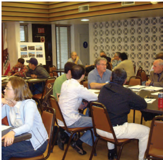
The General Plan is a reflection of the Turlock community's vision for the future of their cities. Residents participated in a variety of ways throughout the process.