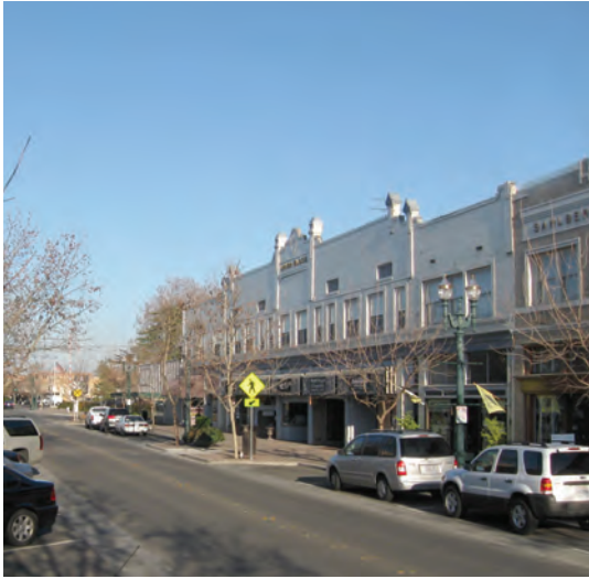
Downtown Turlock is the city's heart, with a unique character and sense of place. The General Plan includes policies to continue strengthening Downtown and other older neighborhoods.

inconvenient to access from existing neighborhoods without a car. General Plan policies counter these trends by calling for the renewed use of traditional neighborhood street patterns and more provisions for bicycle use, including extension of the bicycle route system throughout the whole city. Related policies call for mixed use neighborhood centers, where services and amenities are easily accessible.